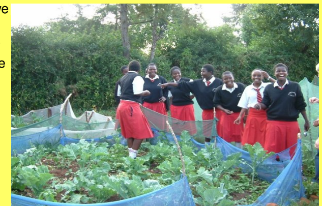
Children in their garden