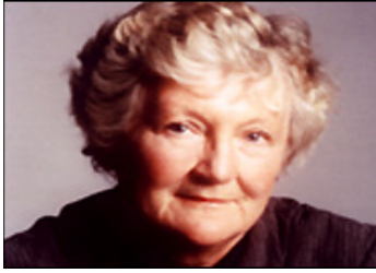
Diana Lamplugh OBE 1936 - 2011